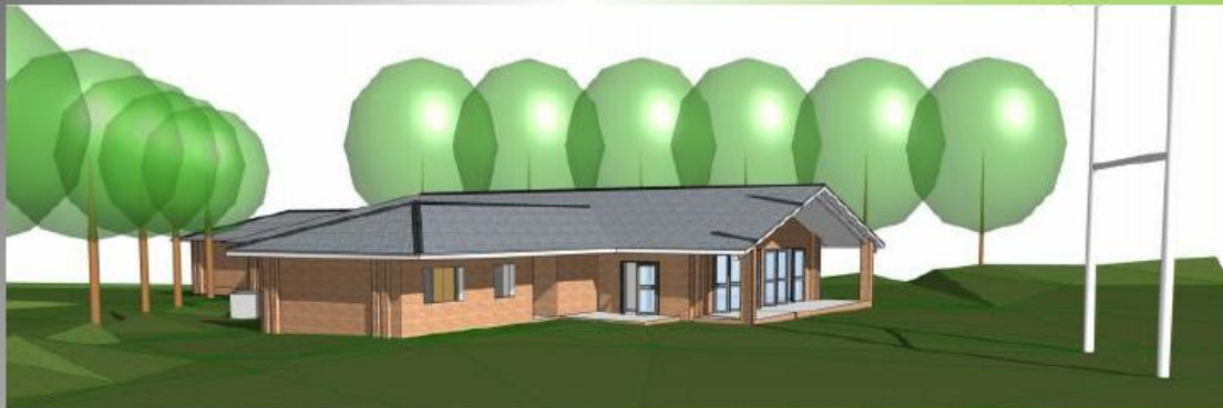
Image courtesy of Flying Buttress Architecture www.flyingbuttressarchitecture.co.uk