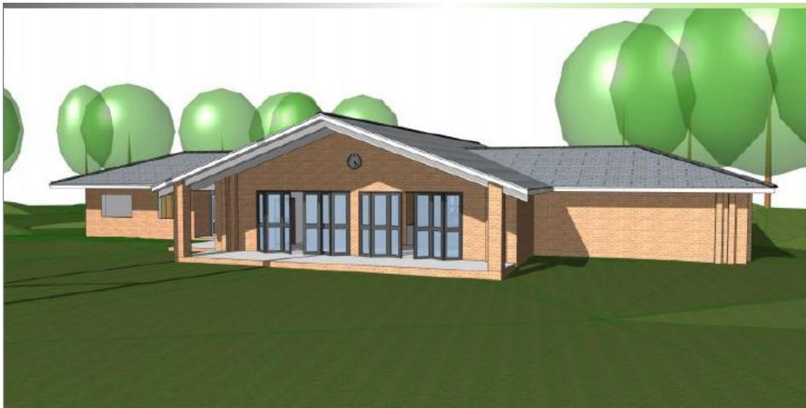
Image courtesy of Flying Buttress Architecture www.flyingbuttressarchitecture.co.uk